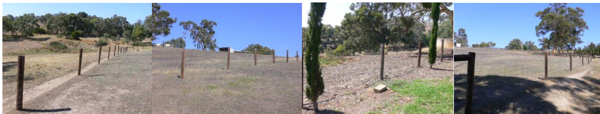
Four fences now ring-locked to prevent animal escapees.