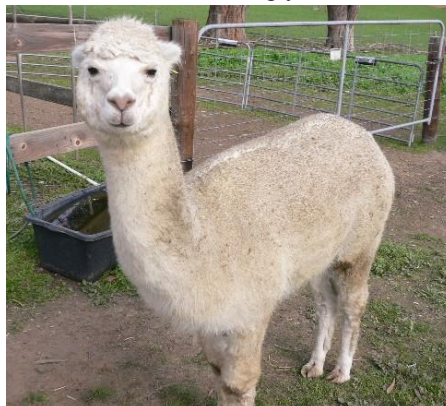
Enjoy your new home, Pria!