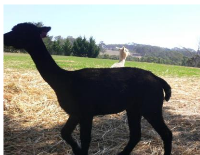
Val has 1 month to go!