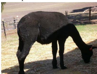
Callista is nearly ready to drop!